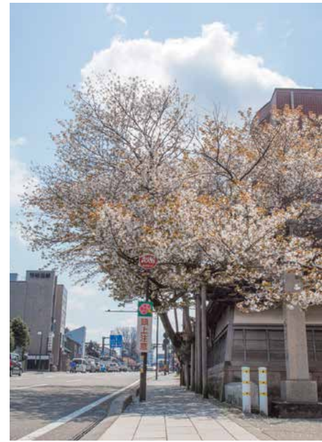
The cherry blossoms of Shogetsu-ji Temple in bloom, extending over the main street

The cherry blossoms of Shogetsu-ji Temple, beloved by many cultural figures since ancient times, have inspired literary works throughout history. In the early 18th century, the Confucian scholar Muro Kyuso 2 , renowned for his outstanding achievements, captured the essence of these cherry blossoms in kan-shi (traditional poetry form originating from ancient China). Additionally, Izumi Kyoka 3 , a modern novelist